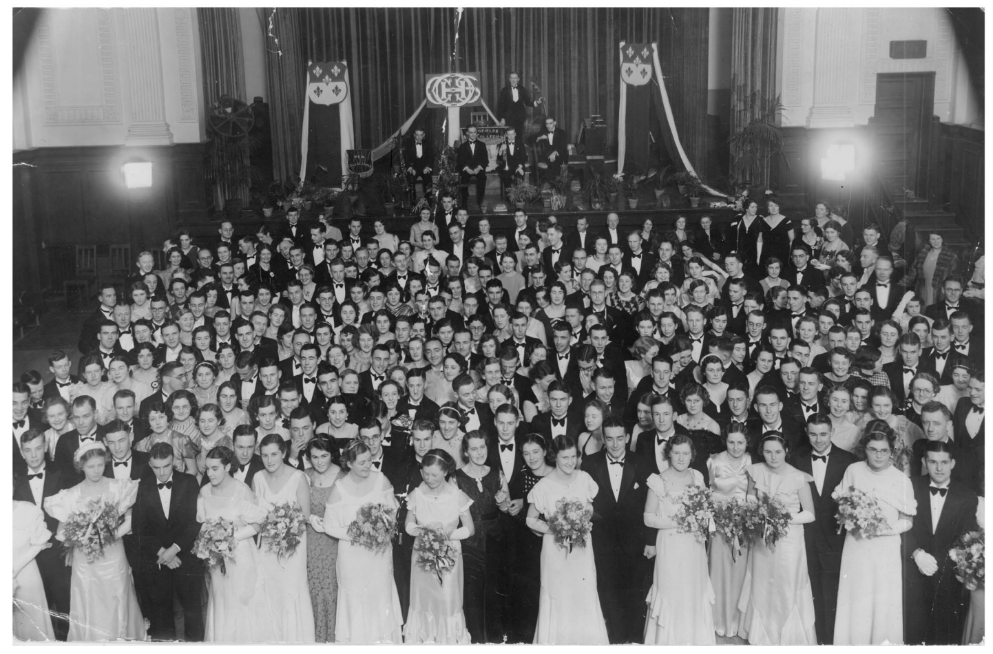
Otago Girls' High School Ex-Girls' Association Ball held in the Concert Chamber, Dunedin Town Hall in 1935. The report in the Otago Daily Times named every woman present with a description of what she was wearing.