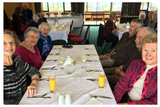
Guests at the Dunedin Branch of OGHS Ex-Girls' Christmas lunch.