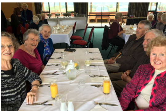
Guests at the Dunedin Branch of OGHS Ex-Girls' Christmas lunch.