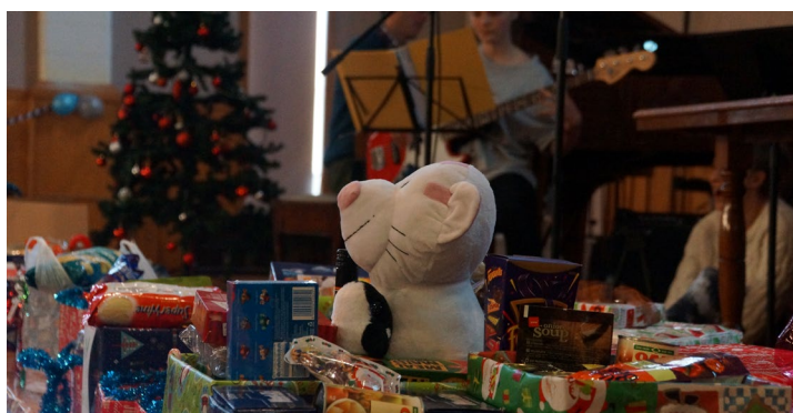
In the spirit of Christmas our Junior students donated 585 food items to Presbyterian Support at their final assembly for the year.

Unfortunately due to postage costs the packs cannot be posted out to ex-students.