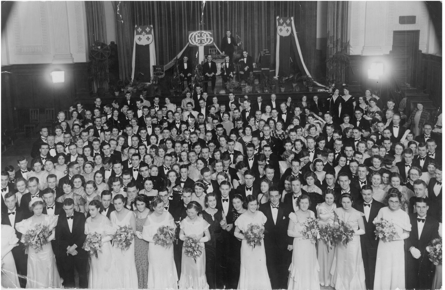
Otago Girls' High School Ex-Girls' Association Ball held in the Concert Chamber, Dunedin Town Hall in 1935. The report in the Otago Daily Times named every woman present with a description of what she was wearing.