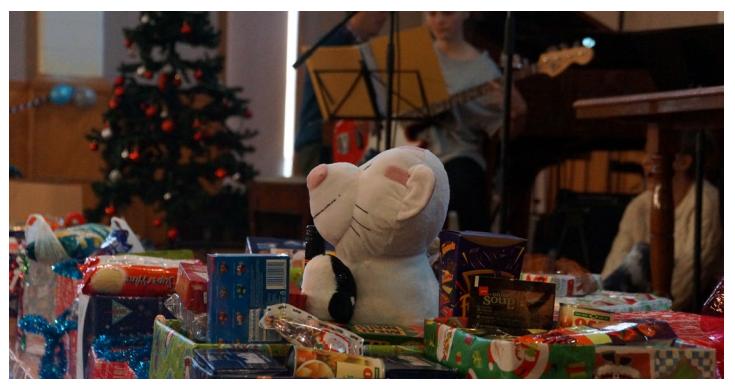
In the spirit of Christmas our Junior students donated 585 food items to Presbyterian Support at their final assembly for the year.

Unfortunately due to postage costs the packs cannot be posted out to ex-students.